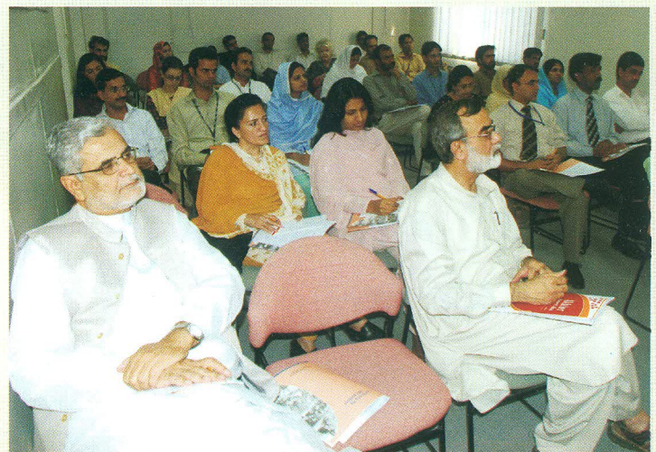
Audiences of Lecture