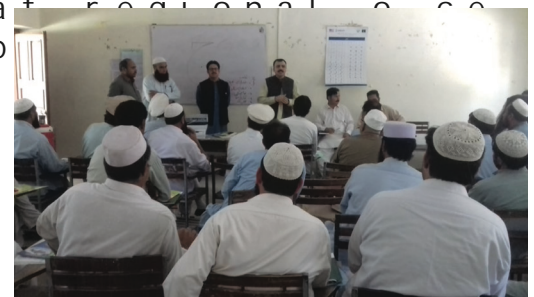
Assistant Director Education, FATA Secretariat addressing the training participants in District Kurram, FATA.

IRM has opened its International office at 29 Lincoln Inn's Field Holborn, London, its first board meeting was held on 15 May, 2018.