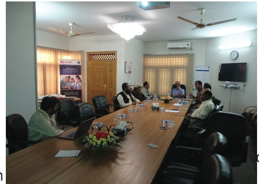
Secretary Education chairing the Meeting with Regional Staff at Regional Office Quetta.

In Balochistan Monthly/Quarterly TIG Meetings were conducted, providing support visits to schools, Reading Learning material distribution and conducting Quarterly Review Meetings in the three cohorts. In addition, its regular follow up and coordination continued with schools and education department. The provincial and district teams also actively participated in the way forward workshop with senior management in the post EGRA scenario. IRM also successfully organized a 3-day CPD workshop for cohort-1 & 2 District staff. Moreover, Secretary Balochistan regional office and he has been briefed about the project goals and objectives and PRP interventions in 17 districts of Balochistan. In the meeting the secretary Education advised that arrange meeting of all the resp (DEOs) of the targeted districts here in Quetta with Secretary Education where they will share progress, issues and challenges regarding project implementation in their respective districts. IRM Team in FATA organized professional development training for primary school teachers (particularly Grade-I teachers) in four districts of FATA (including Khyber, Kurram, Orakzai and FR D.I.Khan). A total number of 920 teachers (625 male and 295 female) were trained on new teaching techniques / methodologies and utilization of intensive reading material introduced by the IRM-PRP in FATA.