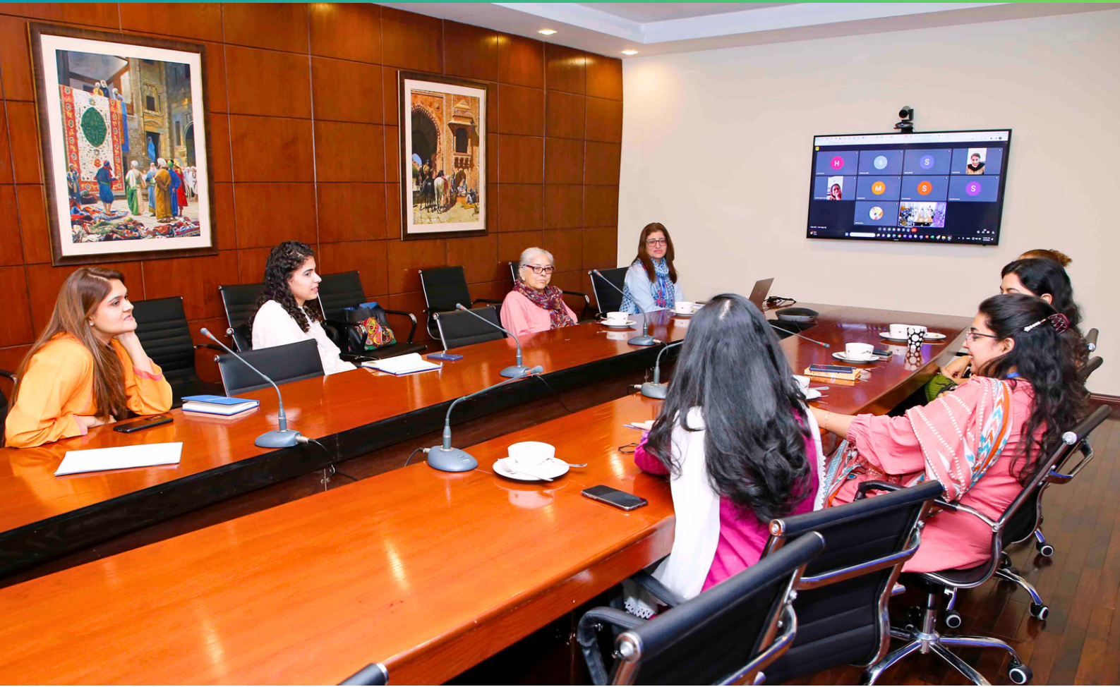
Women Meeting on 7th June 2023